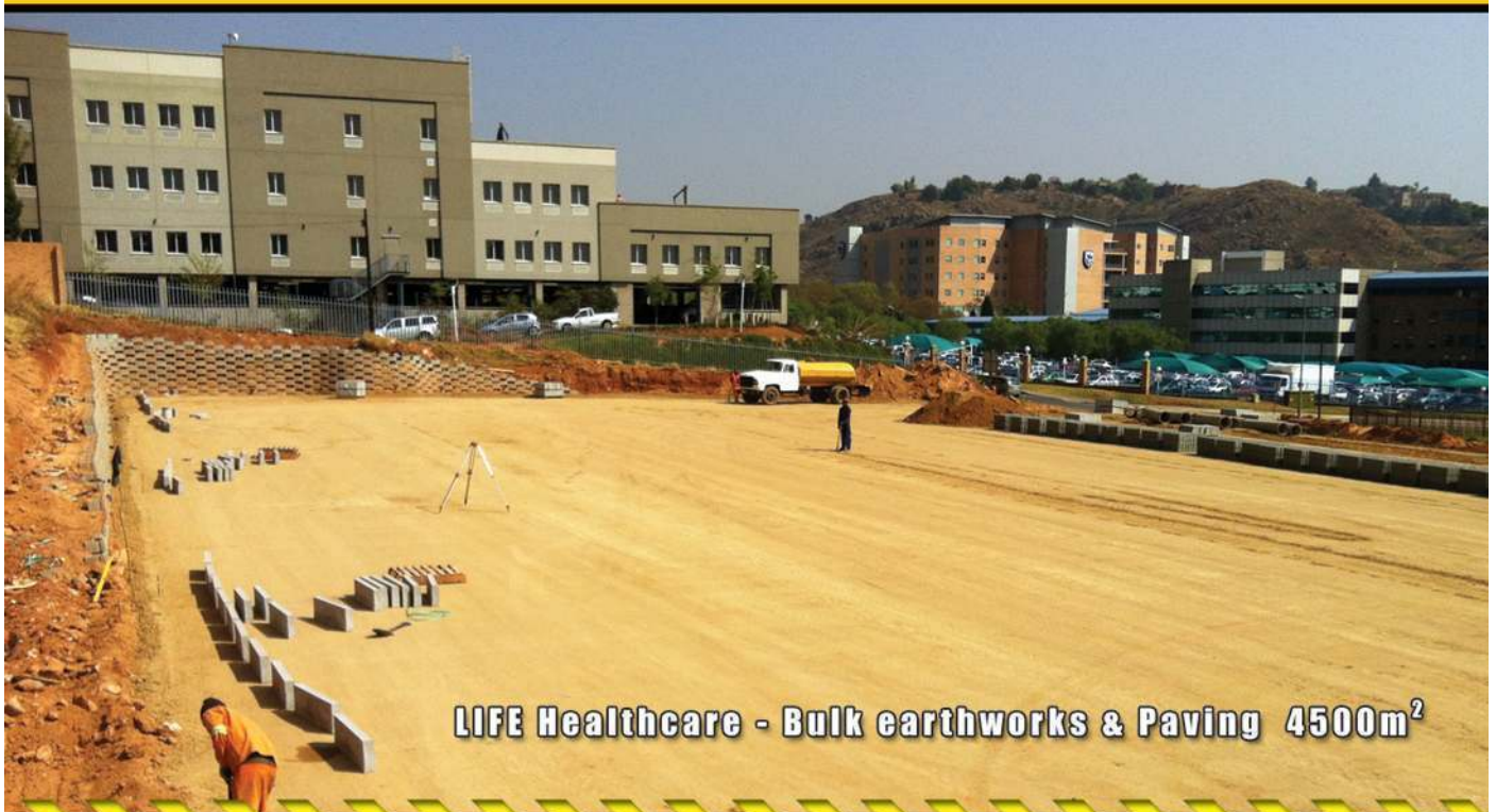
LIFE Healthcare - Bulk earthworks & Paving 4500m 2

Ask any of our satisfied clients, we love the smell of hot-mix in the morning.